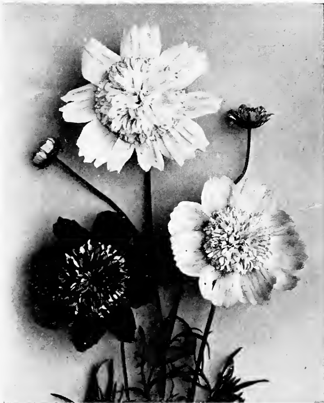
COSMOS, EXTRA EARLY DOUBLE CRESTED